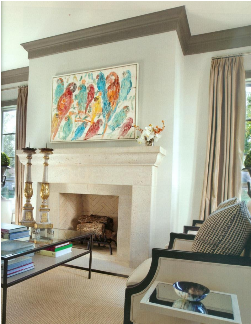
LUXE INTERIORS + DESIGN WINTER 2013